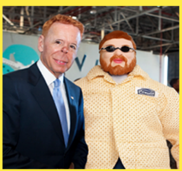
Yore Gala '25 photos inside

Who was this man and why did he have a “big bust”? Page 16